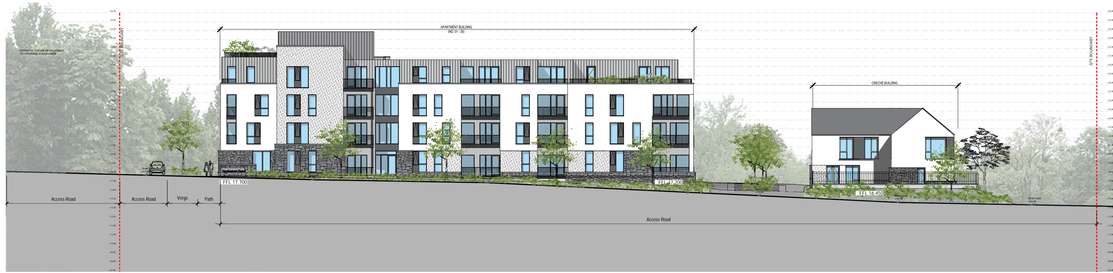
01 Site Context Elevation D-D Scale: 1:200