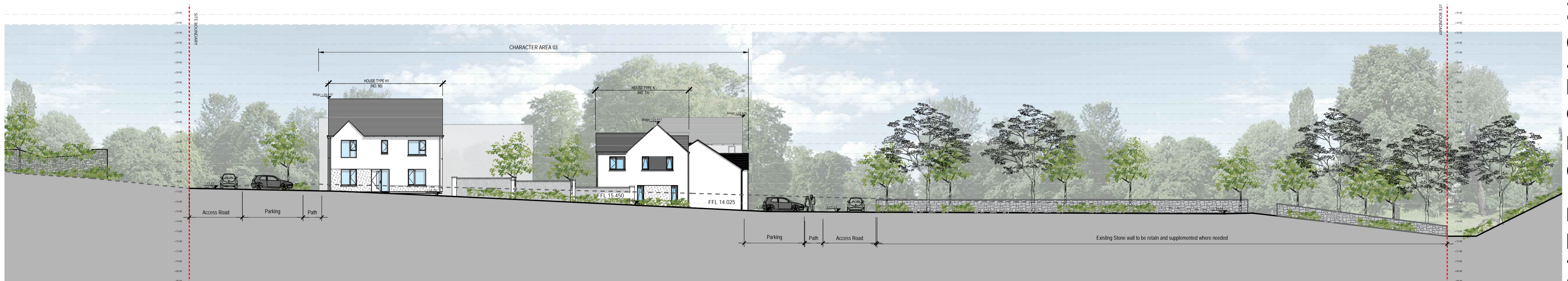
03 Site Context Elevation F-F Scale: 1:200