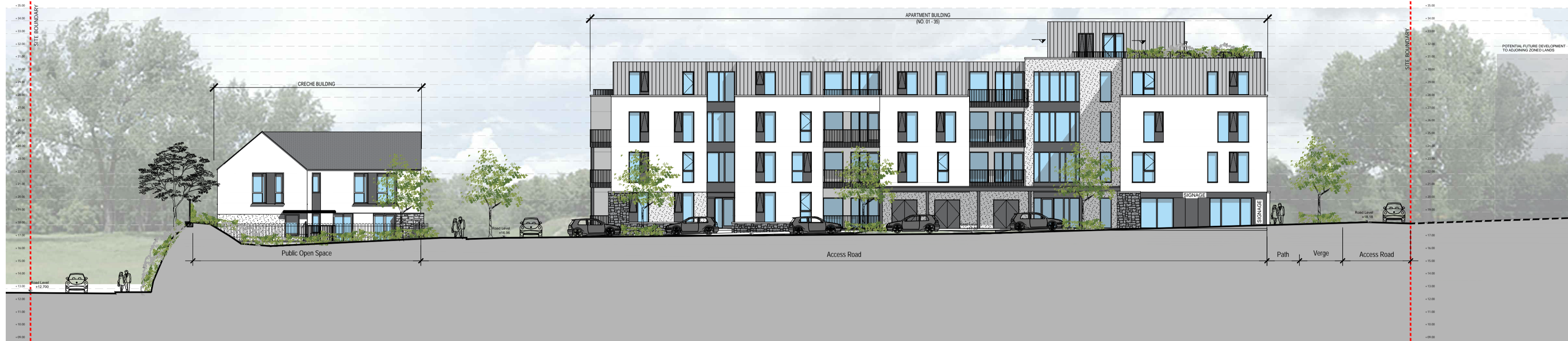
02 Site Context Elevation E-E Scale: 1:200